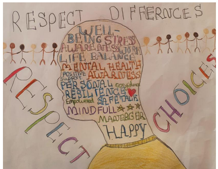
Jessica, age 10

Emotional wellbeing and mental health mean different things to different people. We all have mental health and we must look after it, getting the right support at the right time.