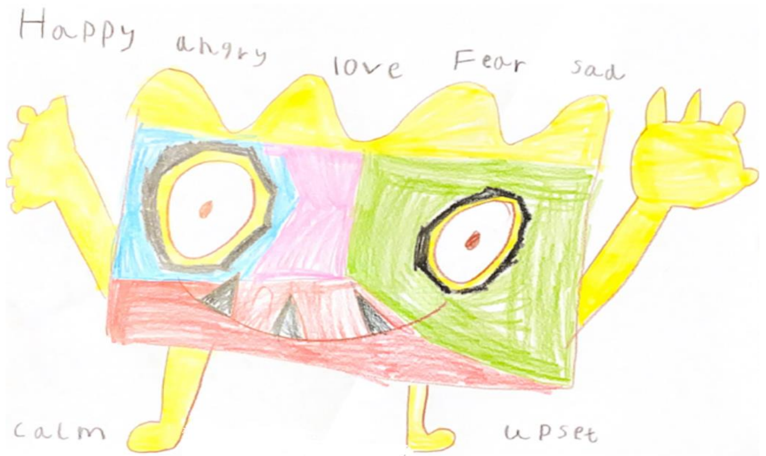
Colby, age 6