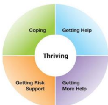
Health Model: iThrive